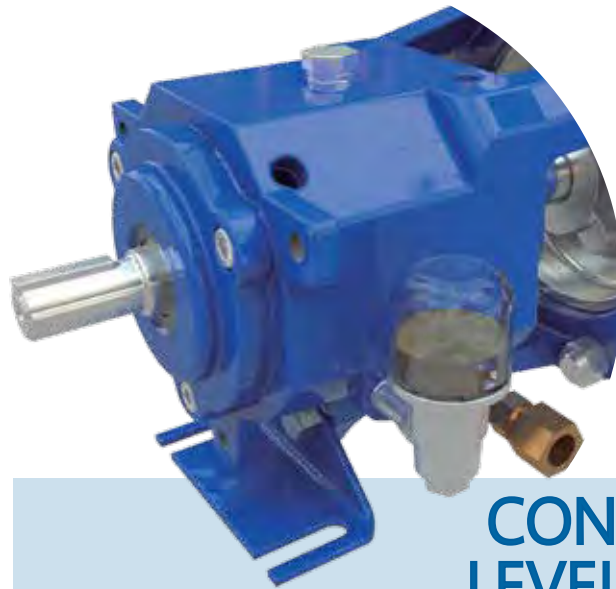
CONSTANT LEVEL OILER